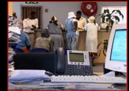
E-Government Shared services TelePresence IP Telephony ICT knowledge transfer