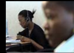
Camtel National IP/MPLS Backbone