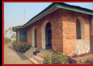
Neh Meyi Women Opportunity Center